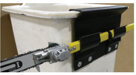
24-23 Long Reach Chainsaw Holder For Telescoping Boom Trucks or Spider Lifts

Holds round- and oval-handled long reach hydraulic chainsaws and gas powered pole pruners (standard and telescoping). 14"H x 18"W x 4"D