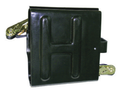
24-02 Circular Saw Holder Includes Handle Holder Unit 11.5" H x 11.75"W x 6.5"D

Offering out-of-bucket storage for tools, these heavy duty tool holders mount on the boom. Water repellent and UV resistant, they are designed to withstand extreme weather conditions.