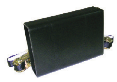
24-04 Hydraulic Pruner Holder Includes handle holder unit 8.25"H x 11.75" W x 2.6"D