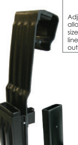
Adjustable clamp bracket allows tool holder to fit any size bucket, with or without liner, and mounts inside or outside bucket.

24-14L Liner Chainsaw Scabbard with Removable Liner Fits standard and hydraulic pistol grip chainsaws. Replaceable liner protects scabbard from chainsaw heat and blade.